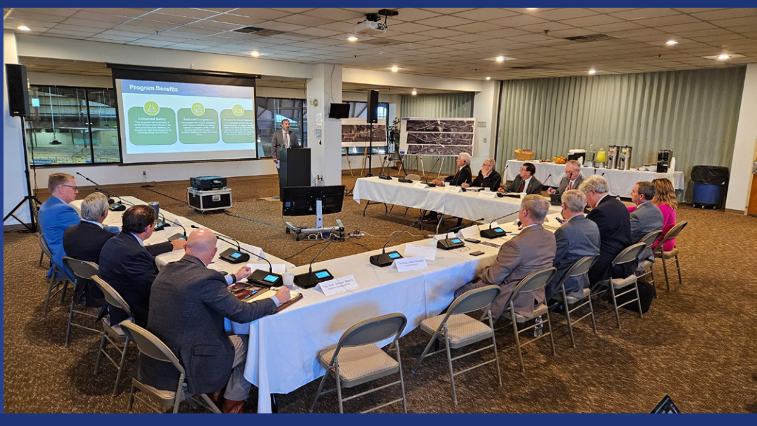
October 2023 - I-81 Advisory Committee receives updates on CIP projects