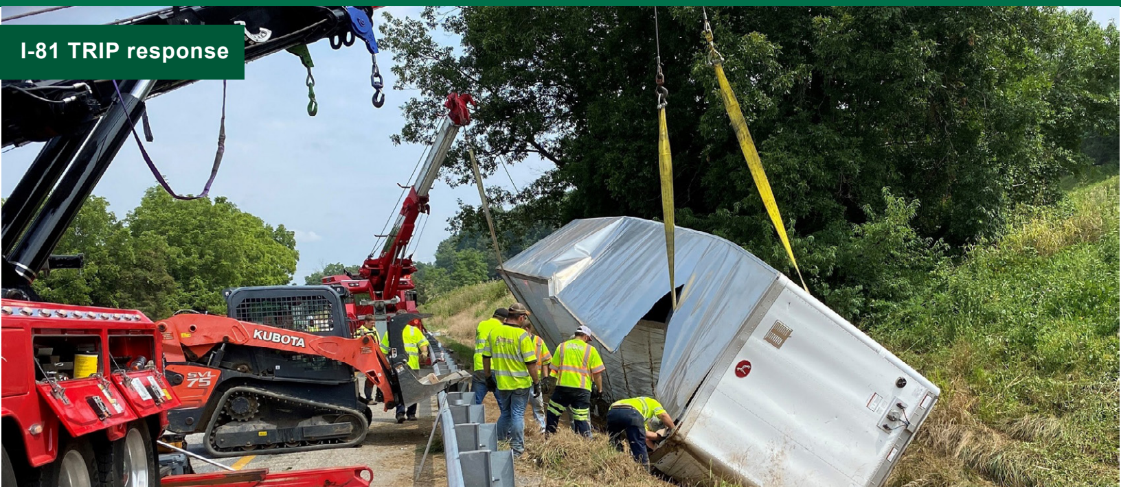
I-81 TRIP response