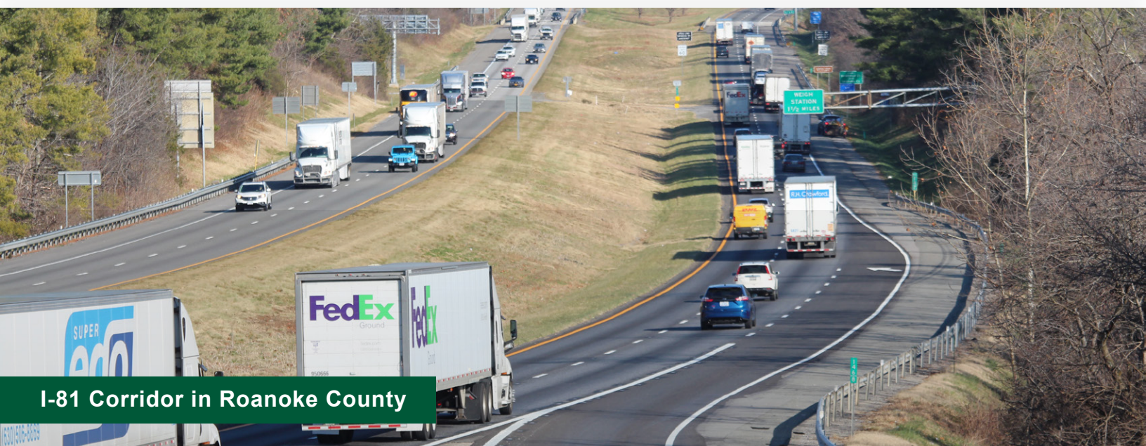
I-81 Corridor in Roanoke County

I know many folks would really like to have that, but we have to work within the given financial constraints. That said, there is a dedicated revenue stream directed to the corridor now, and that funding will remain in place as long as it is supported by the public and the General Assembly. That funding will go towards future 81 corridor improvements. We are delivering major widenings in each of the metro areas of the corridor. In the next five years, the public is really going to see some dramatic improvements. Over time, I think you will see more of the corridor become three lanes in each direction. Continuing to use the performance-based approach we have in place helps to build trust with the public and decision makers. We're following a logical, data-driven process to address the needs.