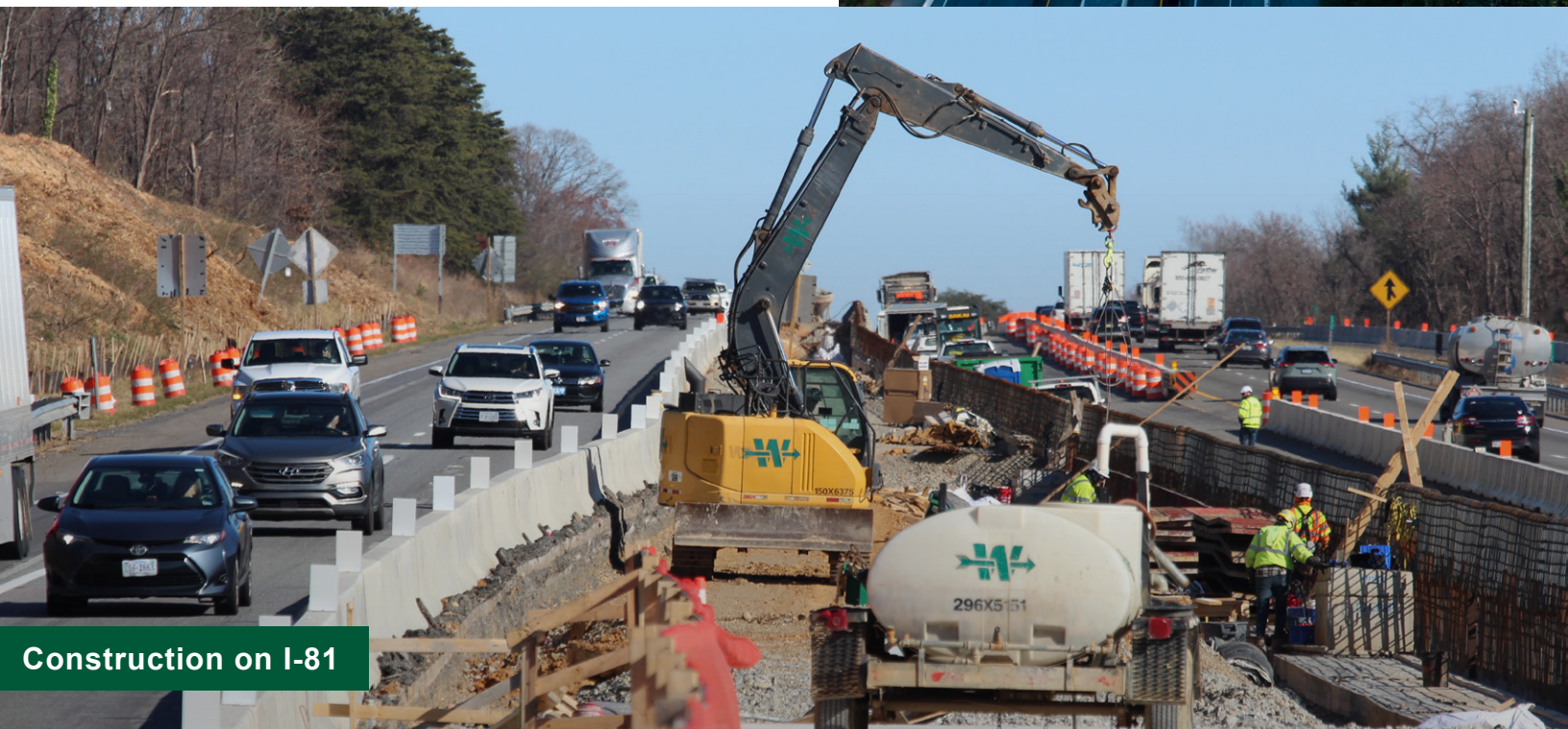
Construction on I-81