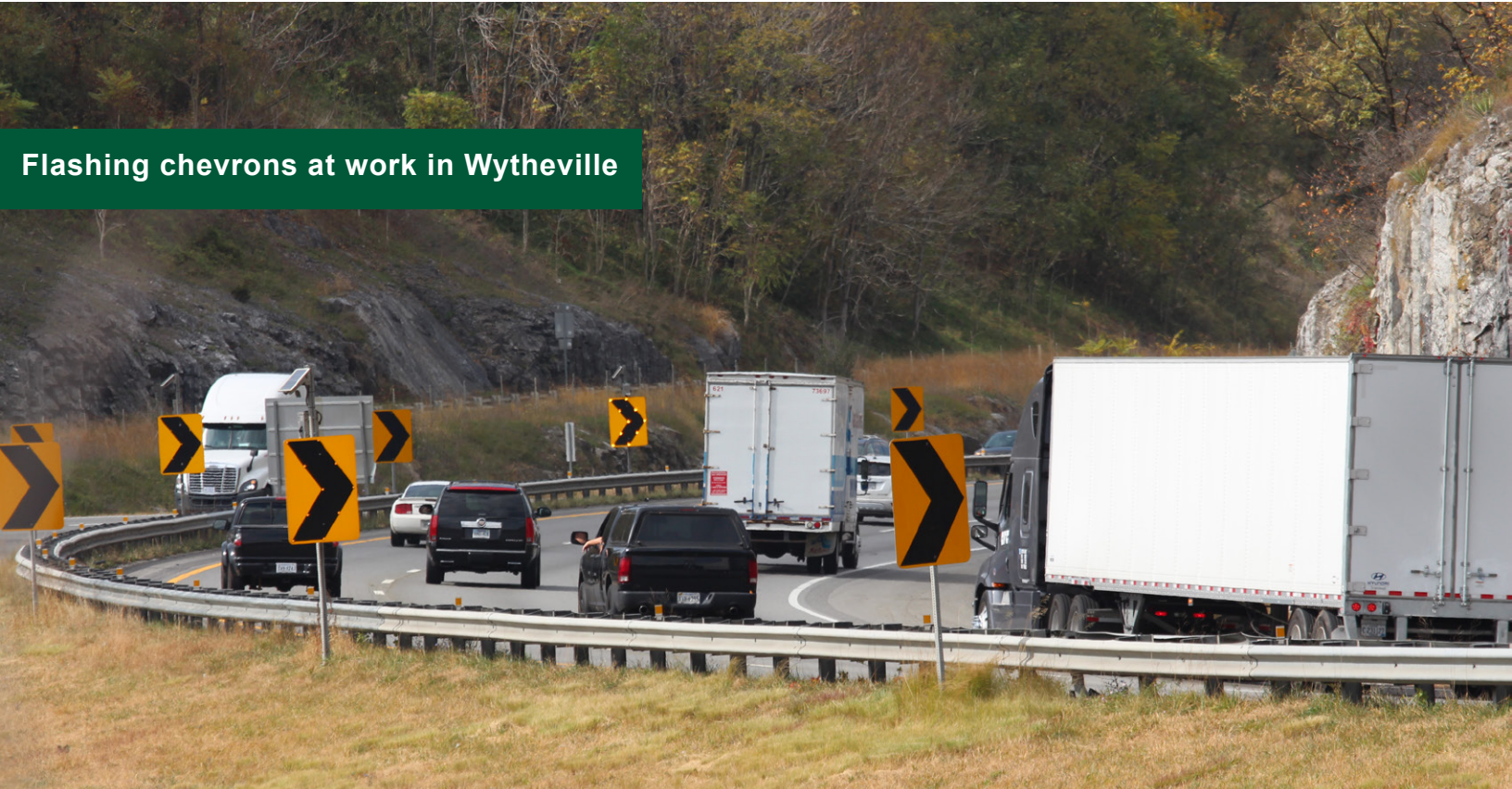
Flashing chevrons at work in Wytheville

-44% reduction in lane-departure crashes in the three curves