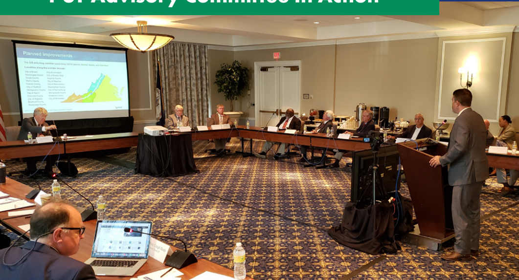
July 2022 Meeting - VDOT speaks to the I-81 Advisory Committee