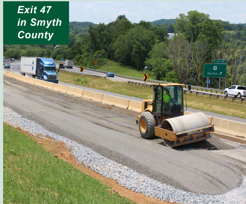
Exit 47 in Smyth County

Exit 47, Smyth County: This is the most costly and complex ramp-extension project in the I-81 CIP. As part of a nearly $7 million design-build contract, A & J Development and Excavation Inc. is adding 0.8 miles to the northbound I-81 acceleration lane near Route 11 in the town of Marion. The project has required blasting and extensive excavation, which allows reconstruction of a steep, curving on-ramp to improve safety and traffic flow. Design and construction work began in 2021, and the project is scheduled to be complete in the fall of 2022. Northbound I-81 in this area has a 24/7 right shoulder closure.