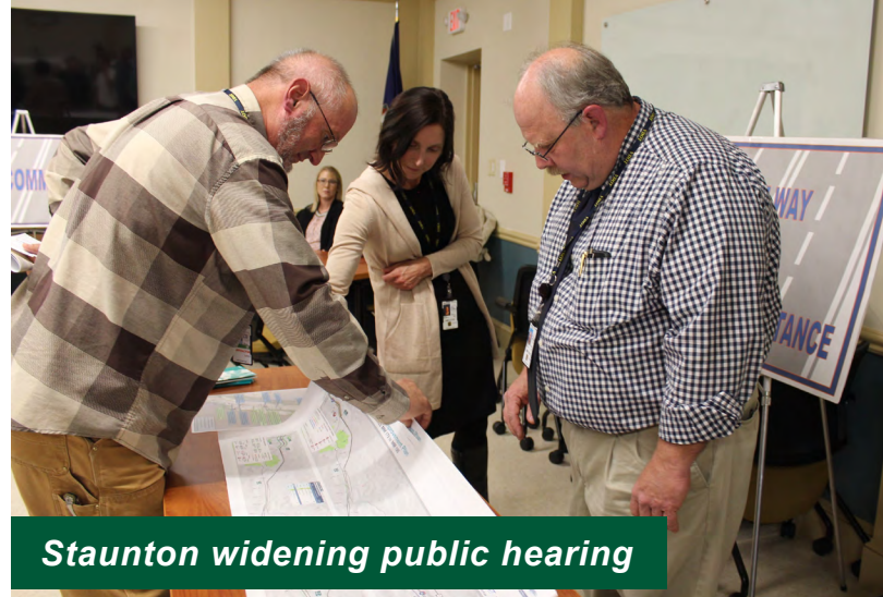
Staunton widening public hearing

The Staunton-area widening will be a design-build project, with a contractor/engineer team finishing the design and proceeding with