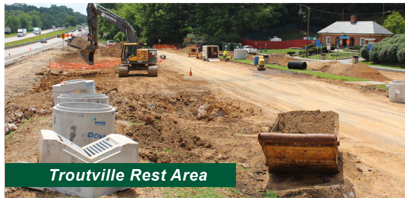
Troutville Rest Area

Exit 137-141 Widening, Salem and Roanoke County: The I-81 CIP's first widening project adds a third lane in both directions between mile markers 136.6 and 141.8. The $179 million design-build project, under the direction of contractor Archer Western Construction LLC, began in early 2022 with shoulder widening and installation of concrete barriers. This work allows traffic to shift slightly away from the median, where the third northbound and southbound lanes will be constructed. This project also includes