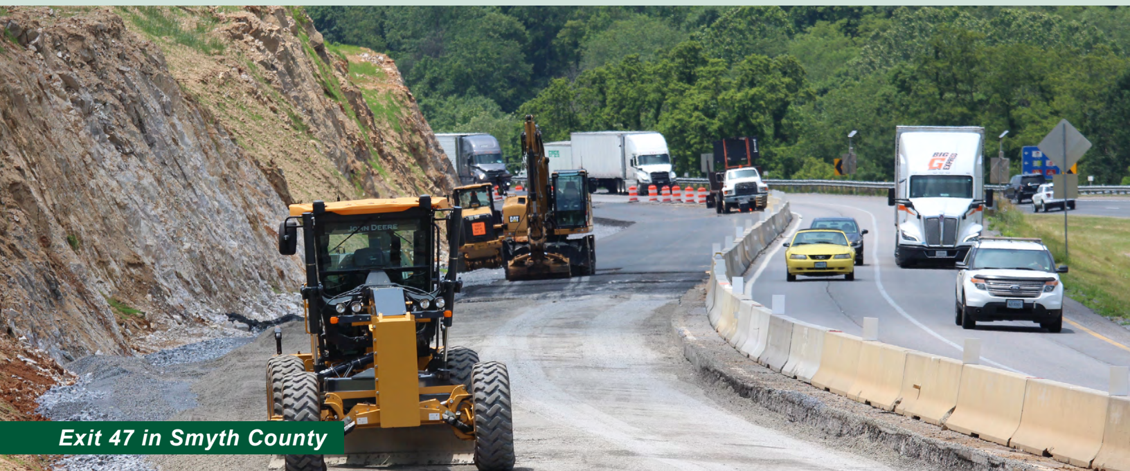
Exit 47 in Smyth County