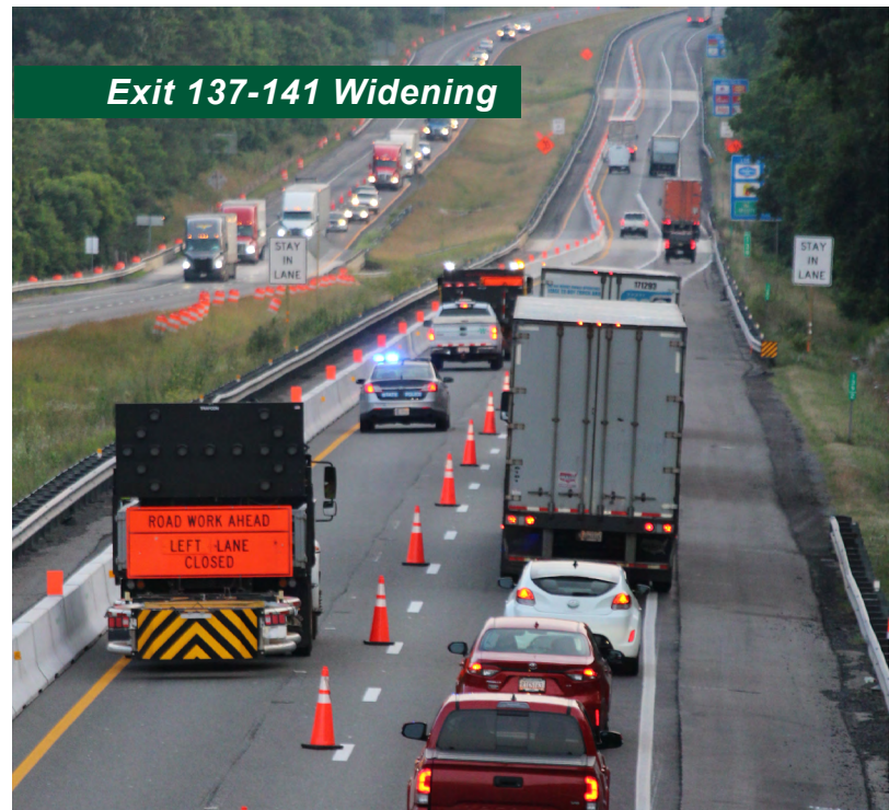
Exit 137-141 Widening