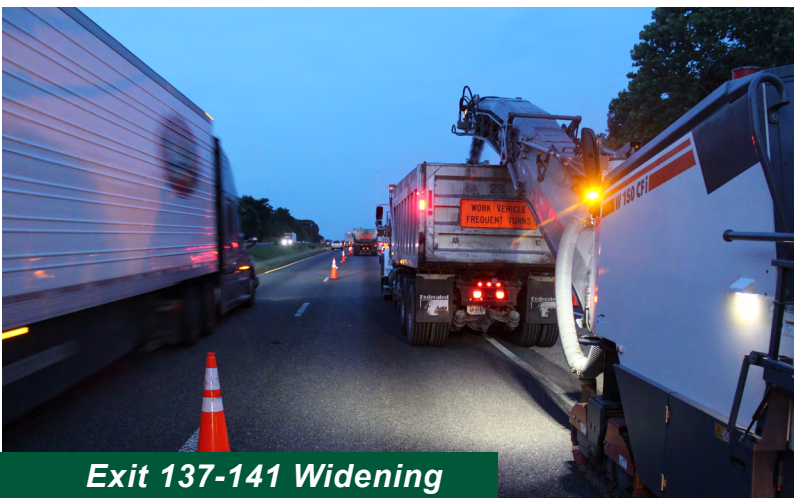
Exit 137-141 Widening

replacement of six bridges and widening of two others. Completion is scheduled for spring 2026. Motorists driving through this portion of I-81 should be alert for northbound and southbound lane closures during evening and overnight hours.