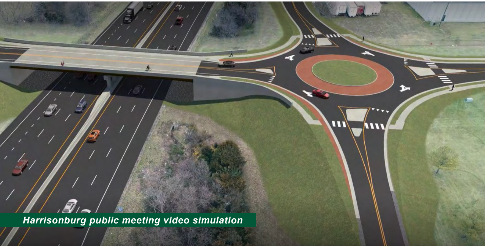
Harrisonburg public meeting video simulation

Additional information about these projects and upcoming public input opportunities are found on Improve81.org . The website is continually updated, so check back often.