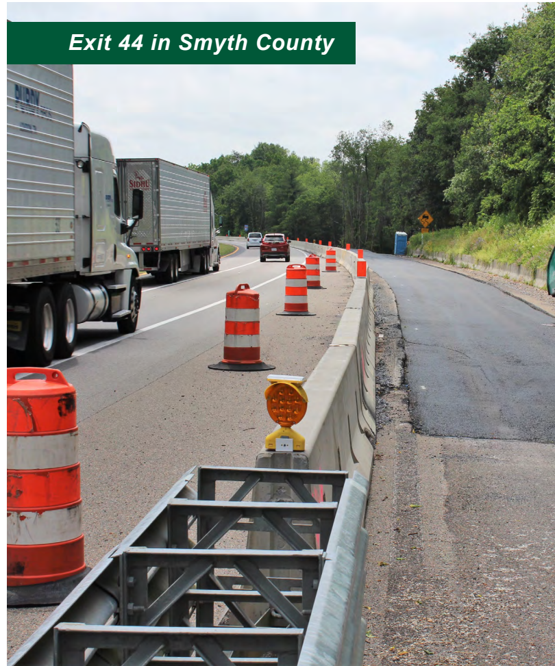
Exit 44 in Smyth County