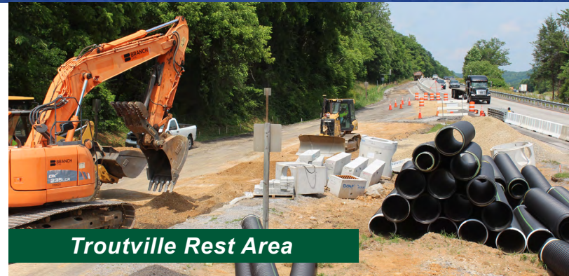
Troutville Rest Area

Troutville Rest Area, Botetourt County: Careful planning and coordination allow the rest area near southbound mile marker 158 to be closed for only three months during a project that brings multiple improvements. Contractor Branch Civil Inc. is extending the deceleration lane (off-ramp) by 500 feet and the acceleration lane (on-ramp) by 2,100 feet. The $4.9 million project also includes an expansion of truck parking by about a dozen spaces. The rest area closed for construction on May 31 and is scheduled to reopen by September 2, just before Labor Day.