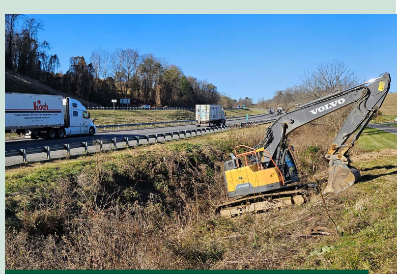
Early work on the southbound I-81 truck-climbing lane in Washington County