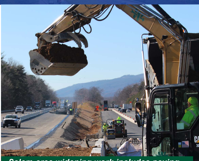
Salem-area widening work includes paving operations and construction of a permanent center barrier

The first widening project in the I-81 CIP has reached the halfway point. Archer Western Construction is building a third lane northbound and southbound between exit 137 (Route 112) and exit 141 (Route 419). The Salem-area project also replaces or widens eight bridges, improves some interchanges and builds 2.6 miles of noise-barrier wall. In some areas of this work zone, I-81 traffic is already using new travel lanes and newlyconstructed portions of some bridges. The